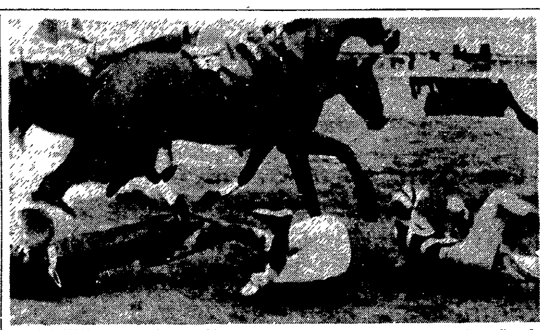
TWO DOWN — Two riders tumble to the turf after their mounts ran into trouble at the Aintree, England steeplechase course yesterday. The jump is part of the Grand National Steeplechase, which will be run Saturday.