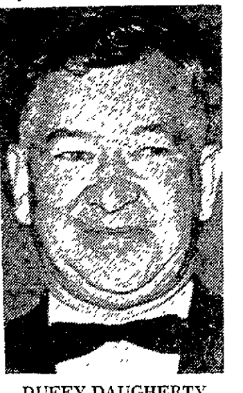
DUFFY DAUGHERTY ... end of line

Thursday afternoon and notified his players that evening after practice. He had originally intended to make his public announcement after the Purdue game but a news leak hastened it. "I told the players football should be fun," Daugherty said, "and it hasn't been. Saturday should be fun, and if you can't have fun on Saturday it isn't worth it. I told the squad: 'I'm not asking you to go out and win the last four games for Duffy. I want you to go out and have some fun.'" Daugherty asked for "re-assignment" in his resignation. He's a full professor at Michigan State and thus has tenure. He offered to help the university and his successor "in any way possible" and the only opportunities which could lure him back to coaching would be at his Alma mater, Syracuse, or a professional coaching job. "I'd only take that if Coach Ben Schwarzwalder resigned," he said of the Syracuse coaching job. Of a pro job he said, "I won't get asked."