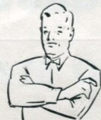
Delay of Game or Excess Time Out