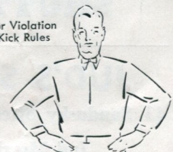
Off-side or Violation of Free-Kick Rules