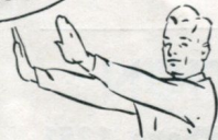
Interference with Fair Catch or Forward Pass